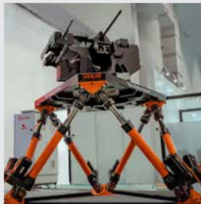
Turret Test Application