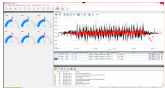
Test System Software