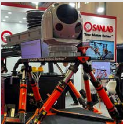
Optical System Test Application