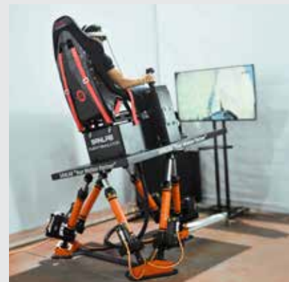
Flight Simulation Application