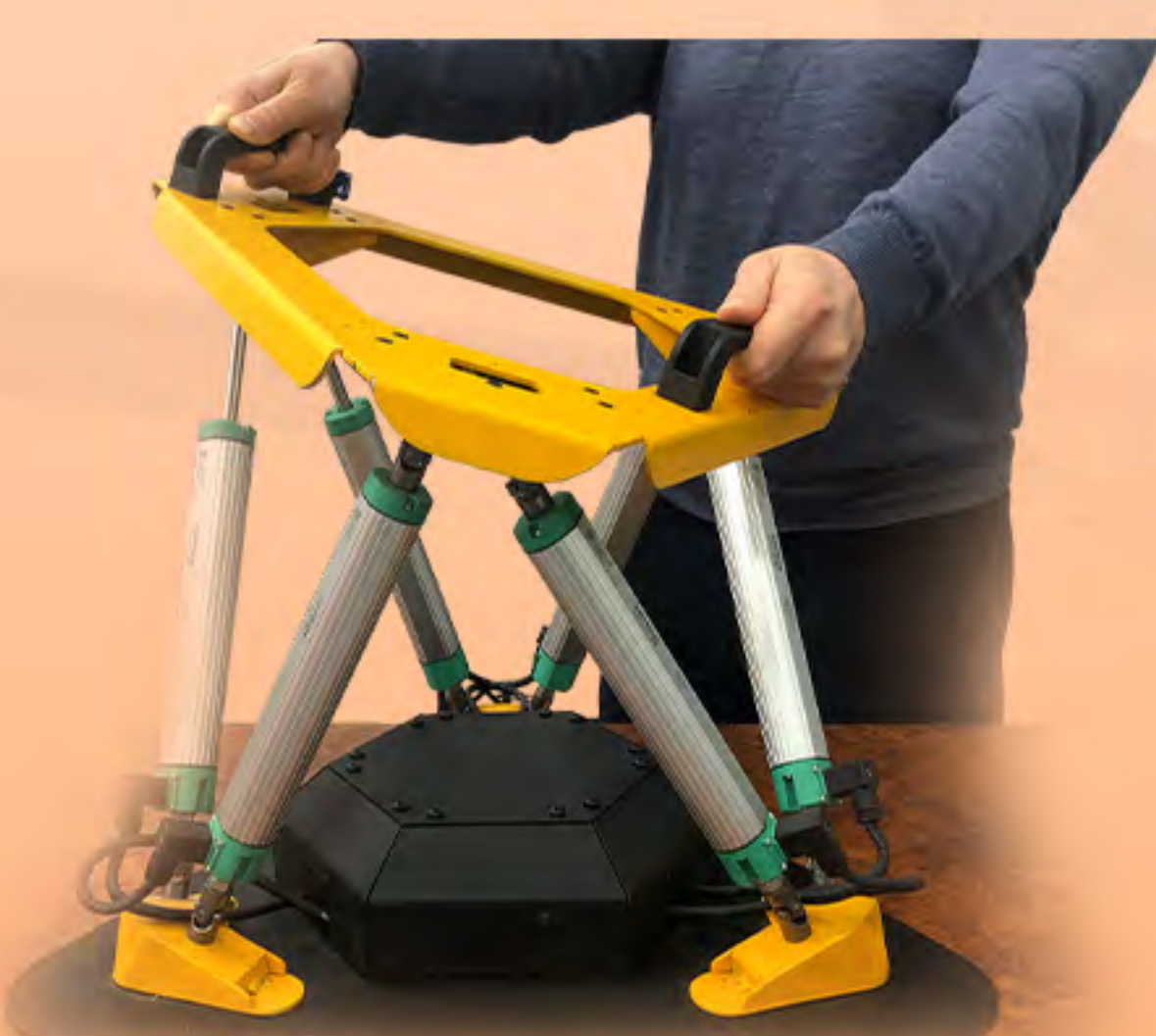
6DOF Motion Controller